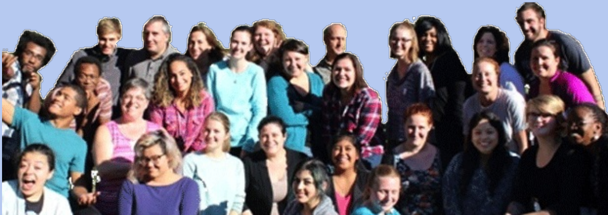
Students from Pacific Lutheran University, Tacoma, WA in GRI workshop