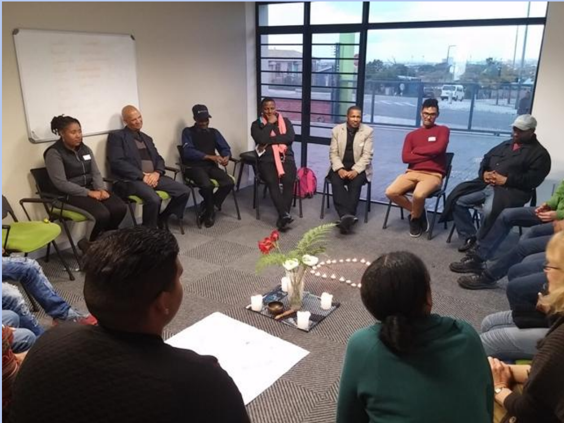
Helenvale community GERI sharing circle

"We shared our life stories and what was bothering us and what we bottled in our hearts. When we shared in both small and big groups the feeling of support and understanding helped me to see that I am not going through my pain alone as I can relate to other people's experiences and life journey. The healing was overwhelming."