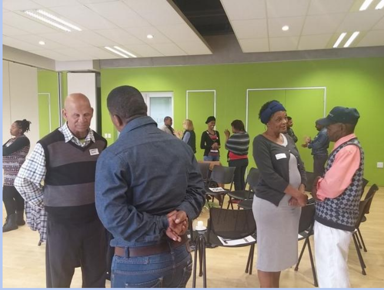
Port Elizabeth participants sharing their gender stories

Helenvale community. This community of leaders, activists and Alternative to Violence Project (AVP) facilitators experienced the depth of healing, forgiveness and liberation that came with sharing their stories with courage and compassion.