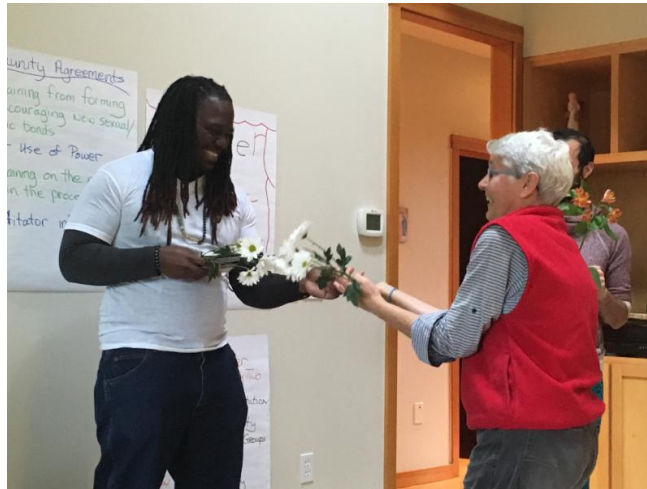
A sweet offering of flowers Men's honoring ceremony to women

In our time together, we witnessed the mystery and resiliency of the human spirit, the heart's capacity to grieve, and to love. The courage of everyday women and men who are striving to walk with integrity in the challenges of life, brought forward a tremendous sense of care, sensitivity, and a renewed commitment to healing and reconciliation.