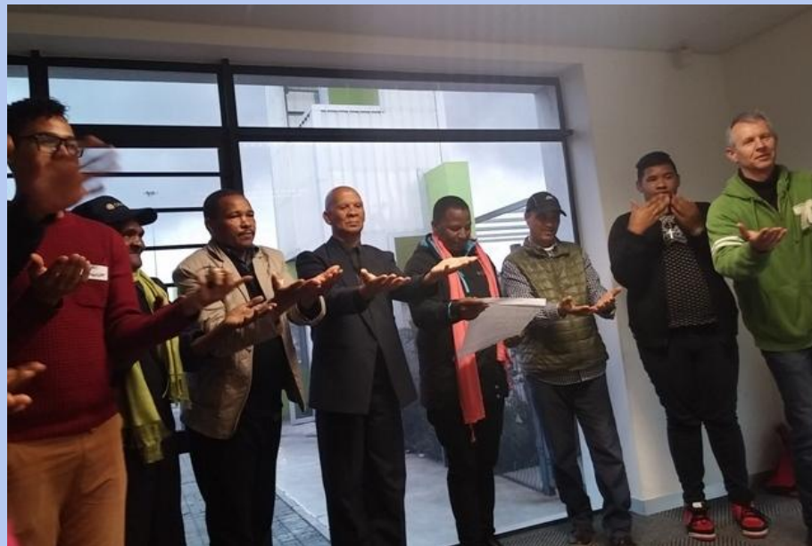
Men offering a poem (see below) they wrote to honor the women during the Port Elizabeth GERI workshop

"We need more of these workshops because we are a broken community. We are prisoners of our own selves. If more people could heal from the inside we would be a better community." ~ Woman participant