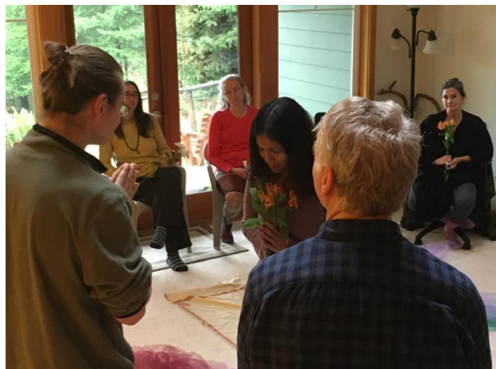
Men's honoring ceremony for the women

In the wake of #MeToo campaign and the ongoing exposure of widespread sexual harassment throughout the country, seven men and eight women gathered in early December to share the truth of their gendered experience, rediscover mutual empathy and care, and begin to reclaim the beloved community that is the birthright of women and men across the globe.