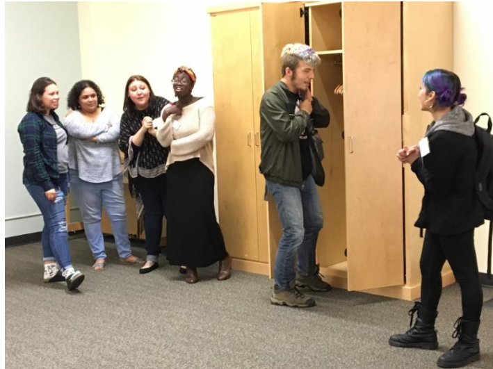
PLU students in GERI psychodrama activity