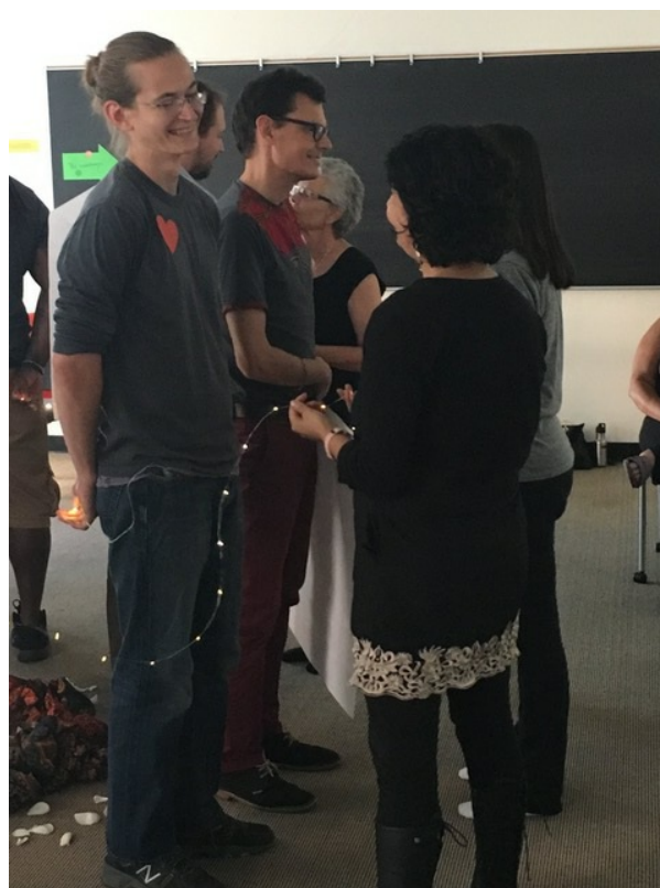
Cross-gender honoring ceremony