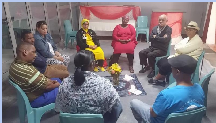
GERI participants in follow-up SOUL group

Bonteheuwel, along with other communities in the Cape Flats have high incidents of gang violence, youth unemployment, drug and alcohol abuse. The SOUL groups are a vital touchstone for participants of past Gender Equity and Reconciliation workshops to cultivate communities of practise in healing the gender divide and transforming the patriarchal oppression that is rife in our communities and our institutions.